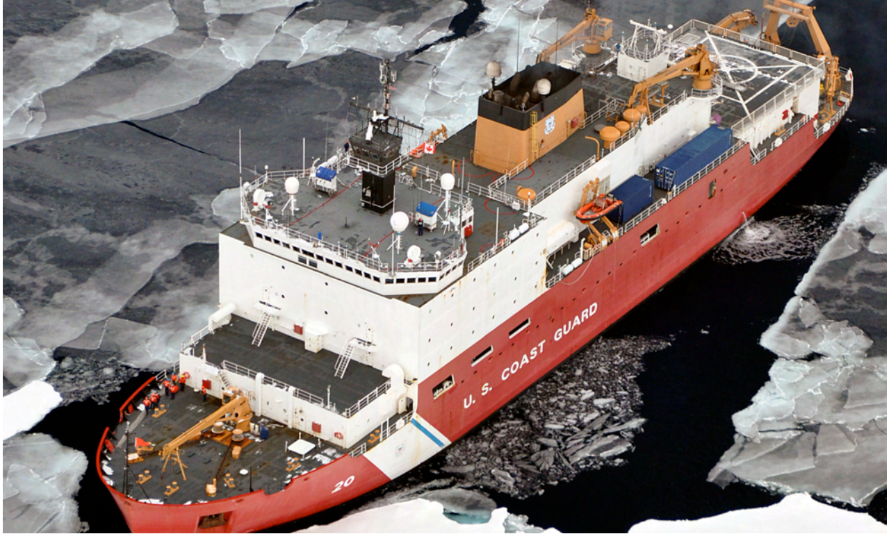
The U.S. Coast Guard Cutter Healy took part in a multi-year, multi-agency Arctic survey in the Arctic Ocean in September 2009 that is intended to help define the Arctic continental shelf. The U.S. Coast Guard and U.S. Navy are increasingly active in the High North.

community, the implications of not integrating climate science into regular decision making processes should not be overstated. The U.S. government, and in particular the national security community, is resilient and capable of operating under uncertainty and adapting to change. But adapting in response to, rather than in advance of, projected climatic changes would likely be less effective and more costly in both economic and human terms. The military, development and diplomatic communities may require long lead times to develop new capabilities, strategies and trained personnel – and position them appropriately – for the future security environment. If these communities do not integrate climate science into their decision making today, they may find themselves less well prepared to meet future challenges.