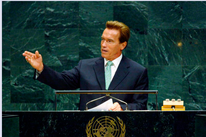
California Governor Arnold Schwarzenegger addressed the U.N. General Assembly before a special session on climate change in September 2007. Governor Schwarzenegger signed Executive Order S-13-2009 in November 2008 directing the California Natural Resources Agency to explore adaptation strategies to a changing climate.

States that are already experiencing climatic impacts (or will in the near future) have been first to implement adaptation strategies. California recently became the first state to release a comprehensive draft of its climate change adaptation strategy. Perhaps it comes as no surprise that California is moving on adaptation policy, because severe drought and wildfires that could be exacerbated by climate change are already persistent issues. 32 The strategy prioritizes six sectors that will likely be most impacted by climate change: public health; biodiversity